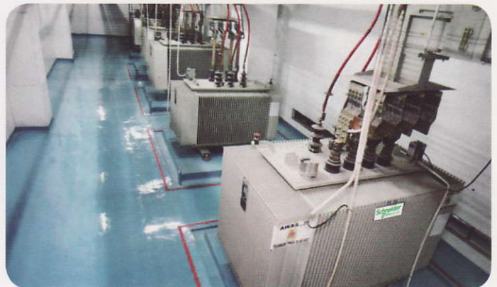
Thamrin City, Shopping Centre and Apartement, Jakarta - Indonesia