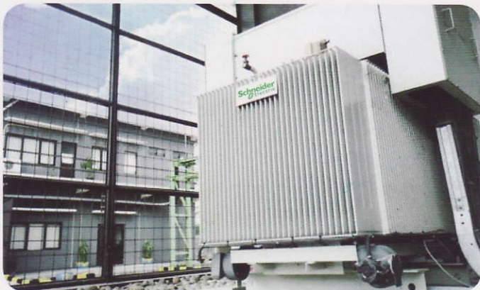
IKPP, Serang - Indonesia